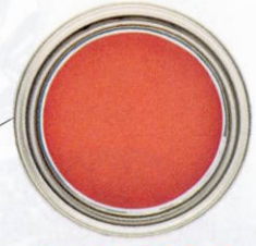
QUITE CORAL SW 6614 SHERWIN-WILLIAMS