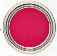
CALIFORNIA WINE A34-6 OLYMPIC