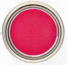
CRANBERRY SPLASH 134-6 PITTSBURGH PAINTS